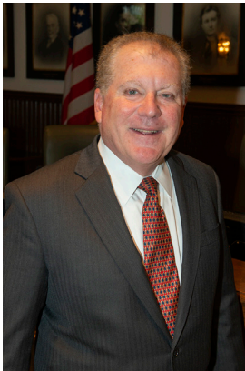
Mayor George A. Pandaleon