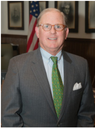
Mayor Robert T. E. Lansing

All City Council members serve on the Finance Committee and the Committee of the Whole. All meetings, except for Executive Sessions, which are exempt by State statutes, are open to the public. The City Council meets on the first and third Mondays of each month (with some exceptions due to holiday schedules) at 7:30 p.m. in the Council Chamber located on the second floor of City Hall, 220 E. Deerpath.