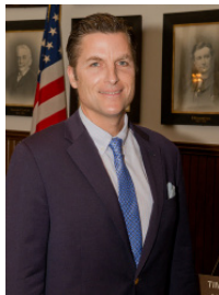
Third Ward Aldermen