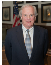
First Ward Aldermen