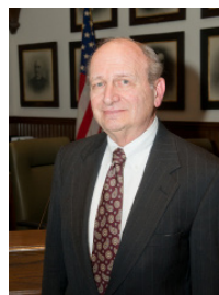
Fourth Ward Aldermen