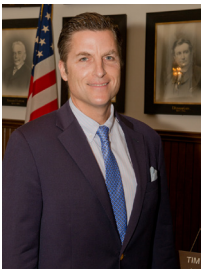
Third Ward Aldermen