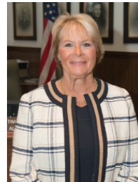
Second Ward Aldermen