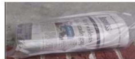
Clear newspaper bags (should be tied to seal)