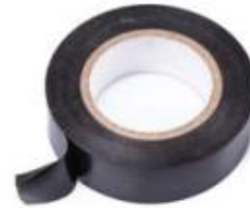
Non-conductive electrical tape

Only tape the terminals, DO NOT cover the entire battery or the chemistry type on battery label.