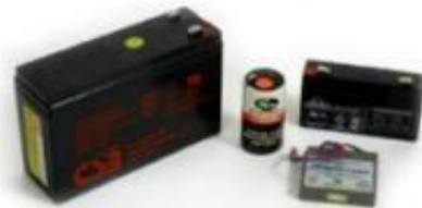
Small Sealed Lead Acid (SSLA/Pb)