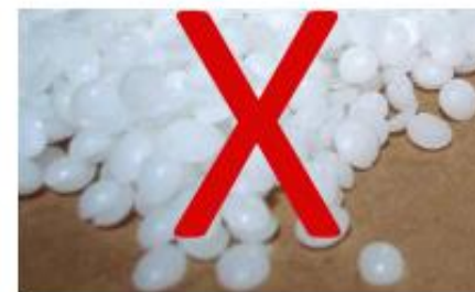
Paraffin or other dipping products