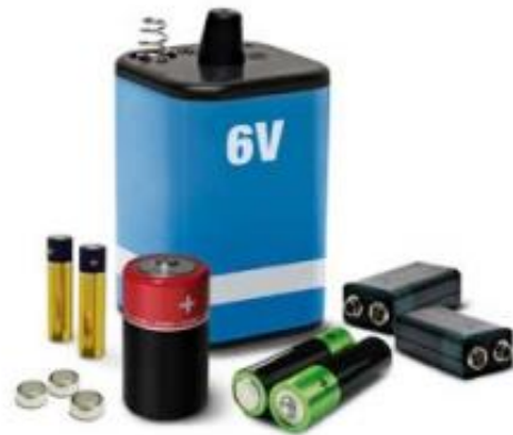
Alkaline: AA, AAA, 6V, 9V, C, D, button cells