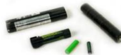
Nickel Zinc (Ni-Zn)