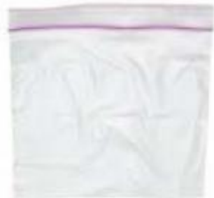
Clear Ziploc® bags