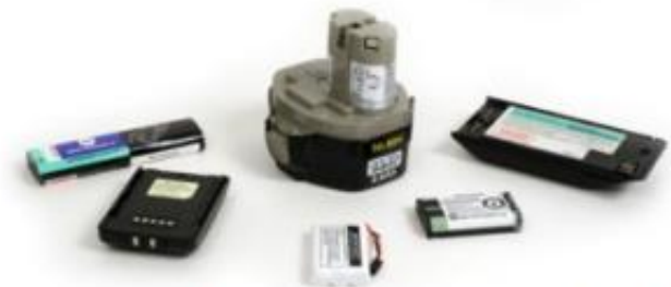
Nickel Metal Hydride (Ni-MH)