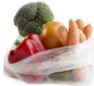
Clear produce bags (should be tied to seal)