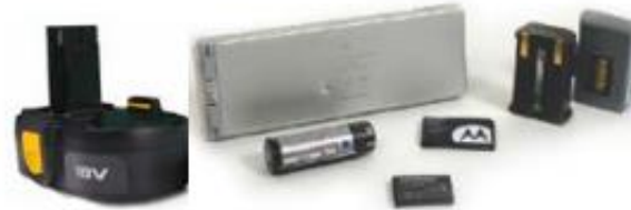
Lithium Ion (Li-Ion)