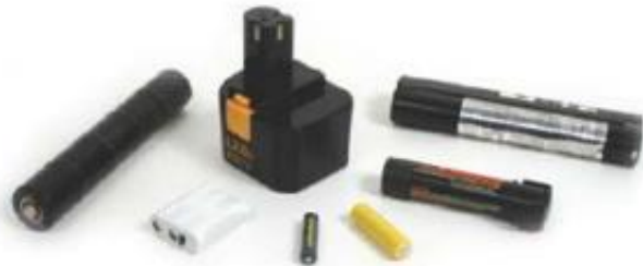
Nickel Cadmium (Ni-Cd)