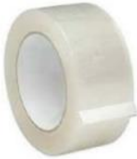
Clear packing tape

You can use these types of tape (clear preferred):